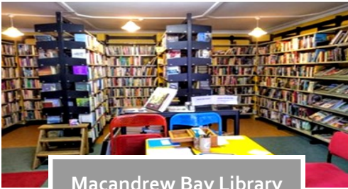
Macandrew Bay Library

Yet again we bought some new books for the library last week and I thought I would tell you how we usually choose them.