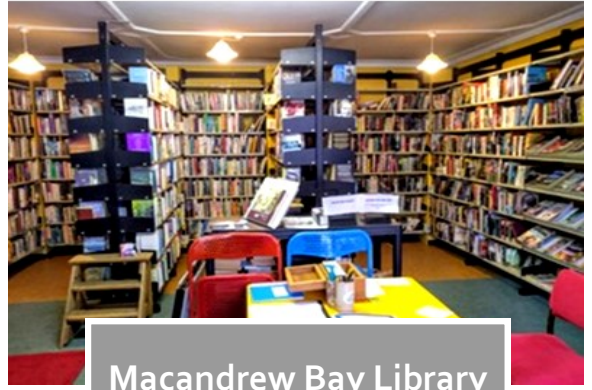
Macandrew Bay Library

The Museum is open every Sunday from 12.30 till 3.30pm. Adults $2 and children are free.