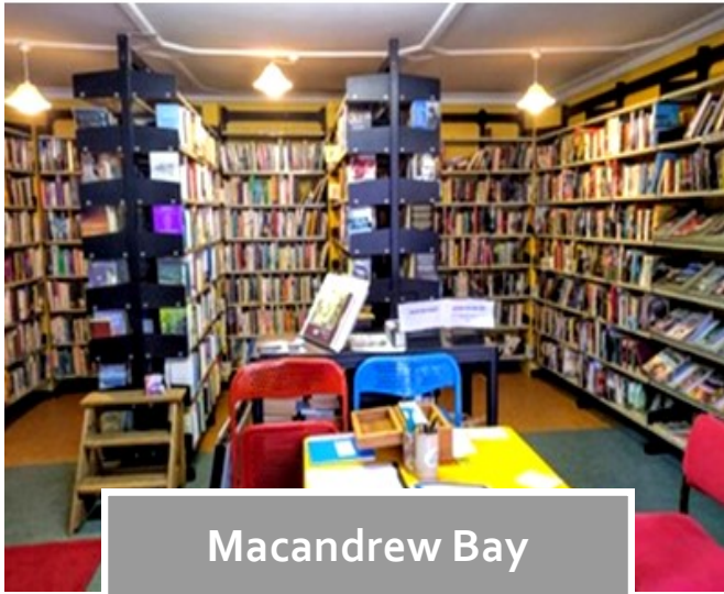
Macandrew Bay Library

The librarians were delighted to hear at Christmas time that we have been given another grant from the Otago Peninsula Libraries Trust with a promise of the same for the next 5 years. This means we are able to buy the latest books and it is gratifying to know how many of our books are on the various Top Ten or Best 100 lists around.