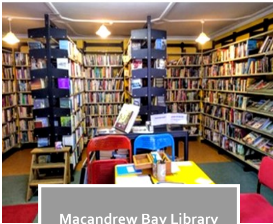
Macandrew Bay Library